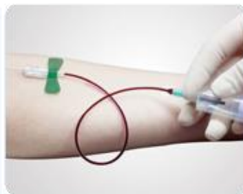
Step2: Insert the tube for blood collection.