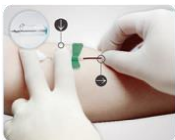
Step3: After completion of blood collection, use middle finger to cover the puncture site with a gauze pad and place the index finger on the curved design to fix, the other hand to withdraw the tubing back to activate the safety mechanism.