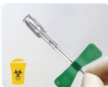
Step4: Audible click indicates activation. Disposal after use.